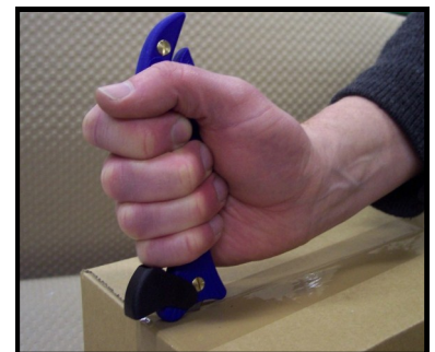
Tape & Card

Also suitable for cutting:- Stretch Wrap, Bubble Wrap, String, Rope etc