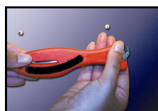
Snap halves firmly back together ensuring there are no gaps. Replace & tighten screws