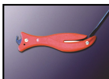
Remove screws with Screwdriver