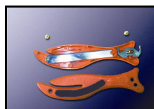
Carefully remove the straight blade