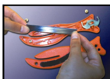
Replace or reverse straight blade by handling blunt edge