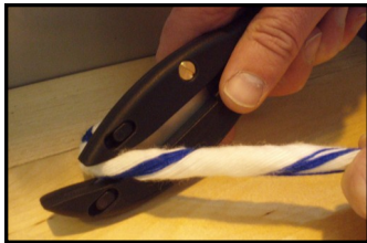
Rope / String