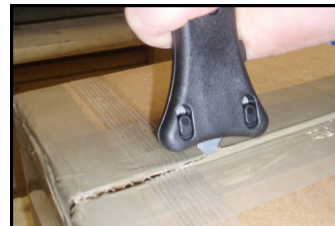
Tape / Card