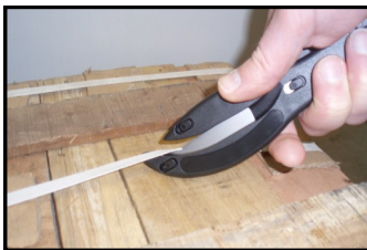
Strapping / Banding

After use the hook blade will automatically retract back into the knife. If you have the knife set to manual retraction, manually retract the hook blade by flicking the bottom of the lever