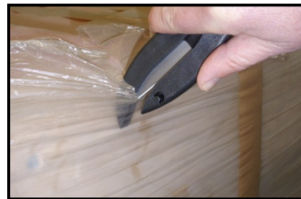
Stretch / Shrink Wrap

Please test detectable products with YOUR detection equipment prior to use