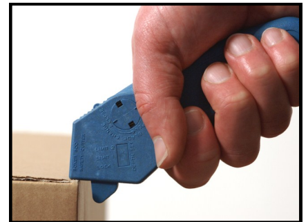
When cutting finishes, guards automatically lock back over blade