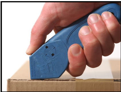
Sprung release lever is pushed forward to unlock guards. Pierce into box.

An innovative, robust box cutter. Moulded in tough glass filled nylon with 'detectable' additive. All metal components are stainless steel.